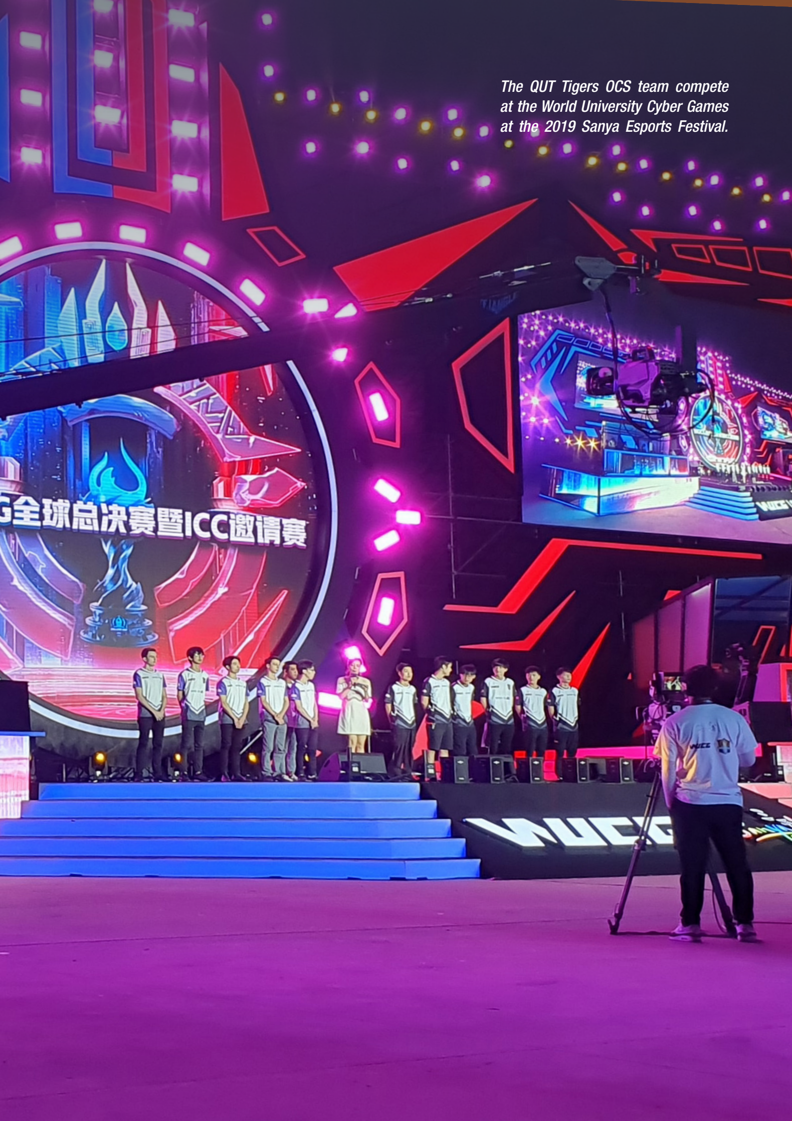
The QUT Tigers OCS team compete at the World University Cyber Games at the 2019 Sanya Esports Festival.